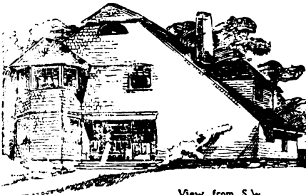
View from S.W.